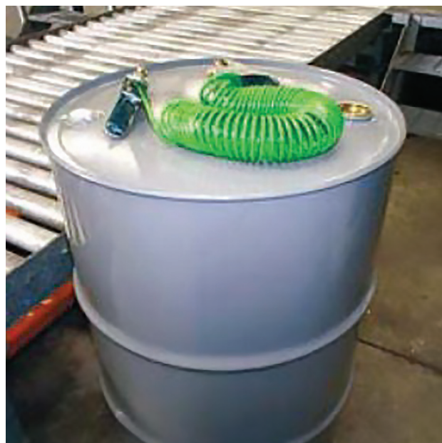
Figure 5. Typical mobile earthing for drums

There is no means of measuring the volume filled into a drum or can, and filling should be via a metering system to ensure overspill does not occur.