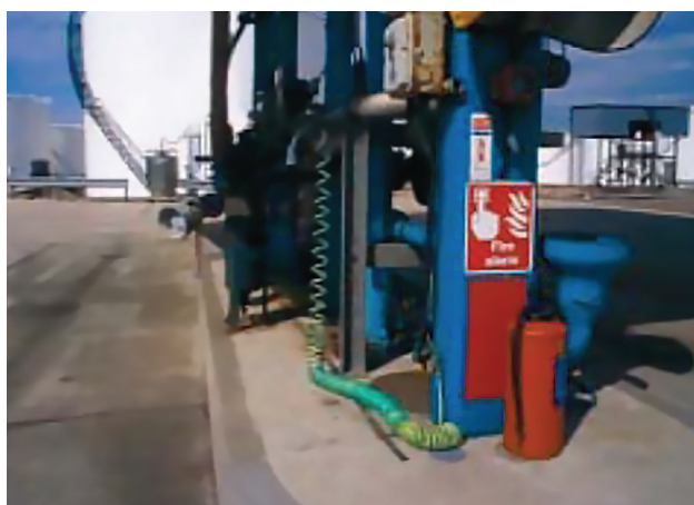
Figure 2. Typical bottom loading stand with provision for making earth connection to a tanker truck).

Rail tankers are earthed through the rail, and there is no general requirement to use special earth. However, if any doubt exists about the electrical continuity between the running gear and the tank, then a special earth should be used with a maximum resistance of 10 \Omega Ref 27 Part 2 Sec 9.4.1 .