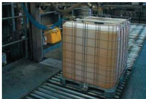
Figure 4. Typical plastic IBC

NOTE: Static-protected plastic composite IBCs are considered to be electrostatically safe with low conductivity and low FP solvents in IEC 60079-32-1 Ref13 and CENELEC TR50404 Ref18 ; the present advice is more cautious.