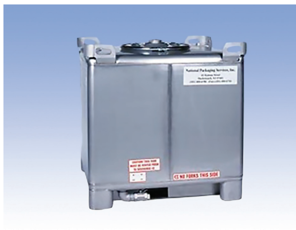
Figure 3. Typical metal IBCs

during and after a fill. Therefore, with these IBCs, the solvent temperature must be kept below the FP by a safety margin sufficient to ensure that flammable mixtures do not occur. A useful safety margin is 15 °C (see 2.2.3), but local codes of practice should be followed because the ambient temperature and required safety margin can vary from country to country.