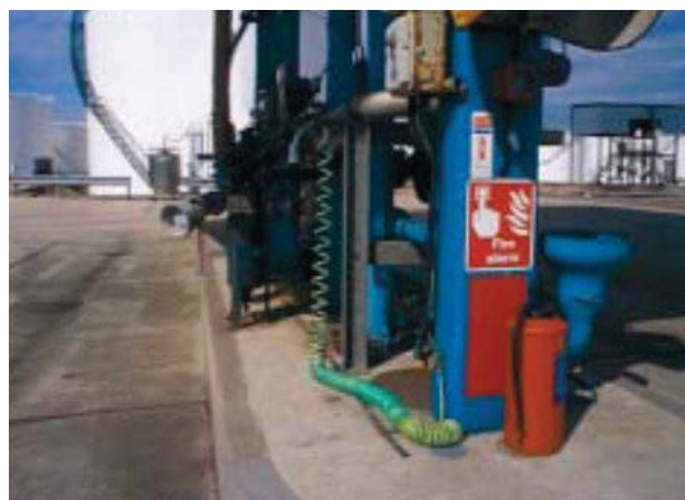
Figure 2. Typical bottom loading stand with provision for making earth connection to a tanker truck

Rail tankers are earthed through the rail and there is no general requirement to use a special earth. However, if any doubt exists about the electrical continuity between the running gear and the tank, then a special earth should be used with a maximum resistance of 10 \Omega Ref 23 Part 2 Sec 9.4.1 .