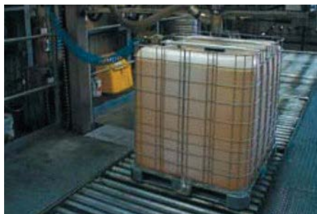
Figure 4. Typical plastic IBC

Plastic composite IBCs generally consist of a plastic “bottle” surrounded by metal sheet, mesh, or frame: a typical metal mesh example is shown in Figure 4. For IBC selection, a distinction should be made between Standard (static-unprotected) IBCs and Static-protected IBCs.