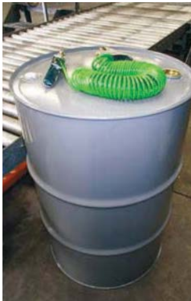
Figure 5. Typical mobile earthing for drums

There is no means of measuring the volume filled into a drum or can and filling should be via a metering system to ensure overspill does not occur.