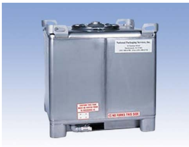
Figure 3 shows typical metal IBCs. These may be used for solvents of any Flash Point or conductivity