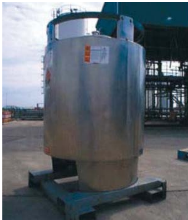
Figure 3. Typical metal IBCs