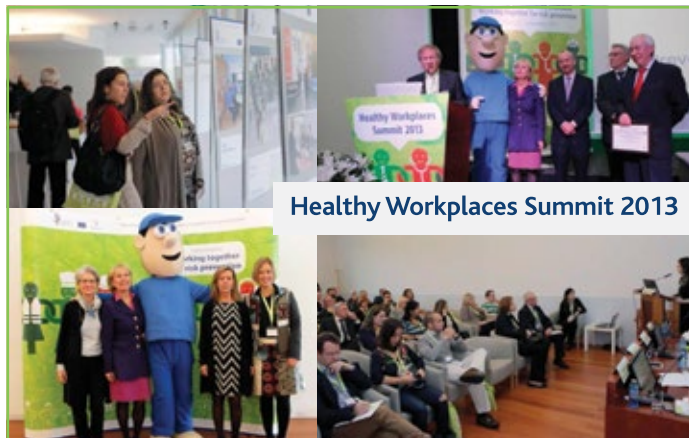
Healthy Workplaces Summit 2013

On the 11 th and 12 th of November, a two day summit in Bilbao closed the EU-OSHA campaign 1 'Working together for risk prevention'. Among the participants were leading occupational safety and health professionals as well as representatives from the European Commission, the Commissioner for Employment, Social Affairs and Inclusion, the EU Presidency and representatives from national and local governments.